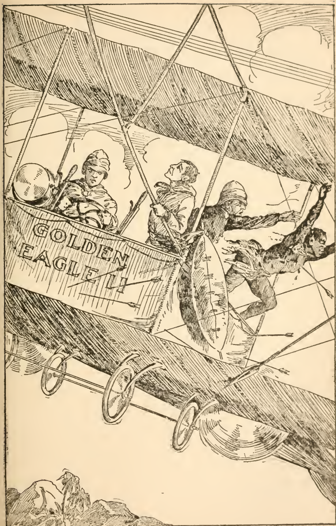
The Golden Eagle escapes from the savages.