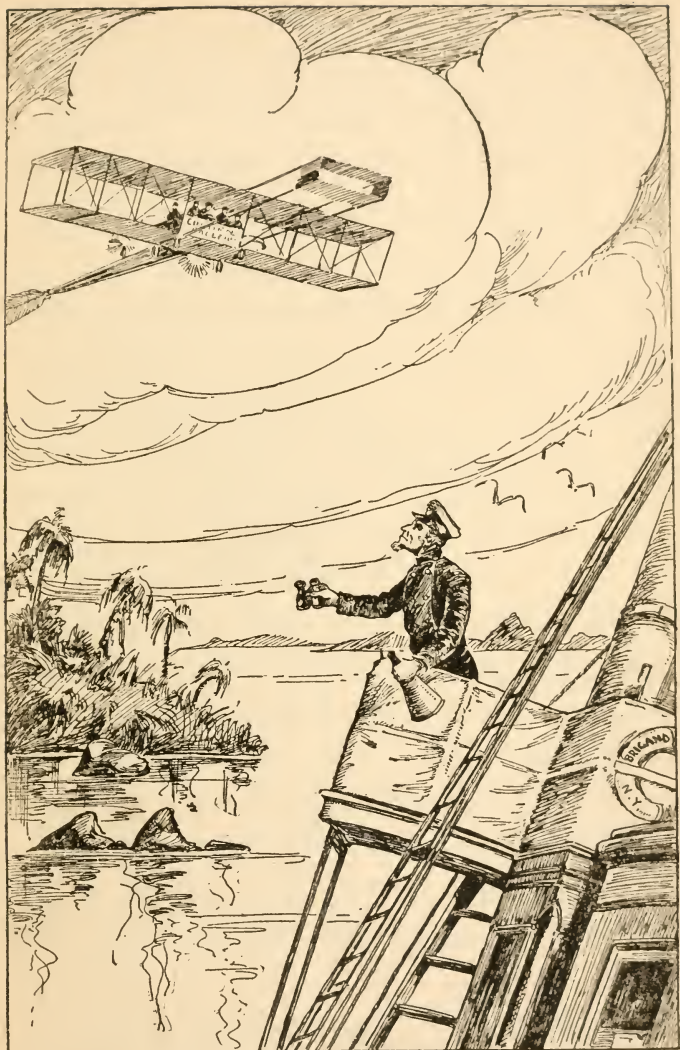
The Golden Eagle reaches the Brigand .