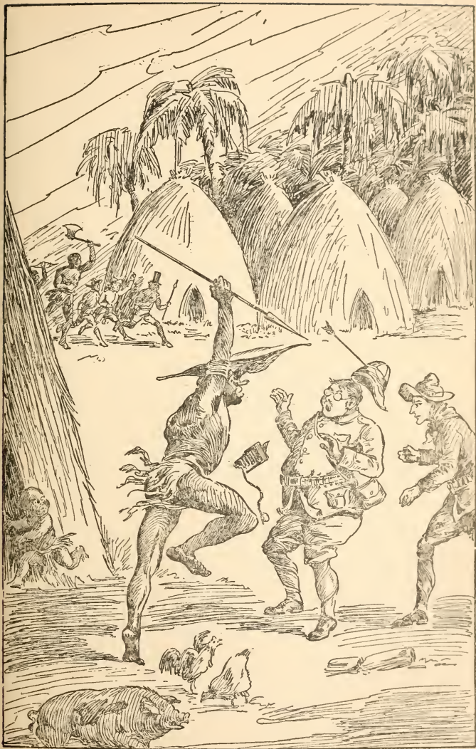
Billy Barnes is suddenly scared.