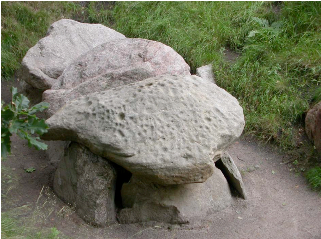
detail of the chamber