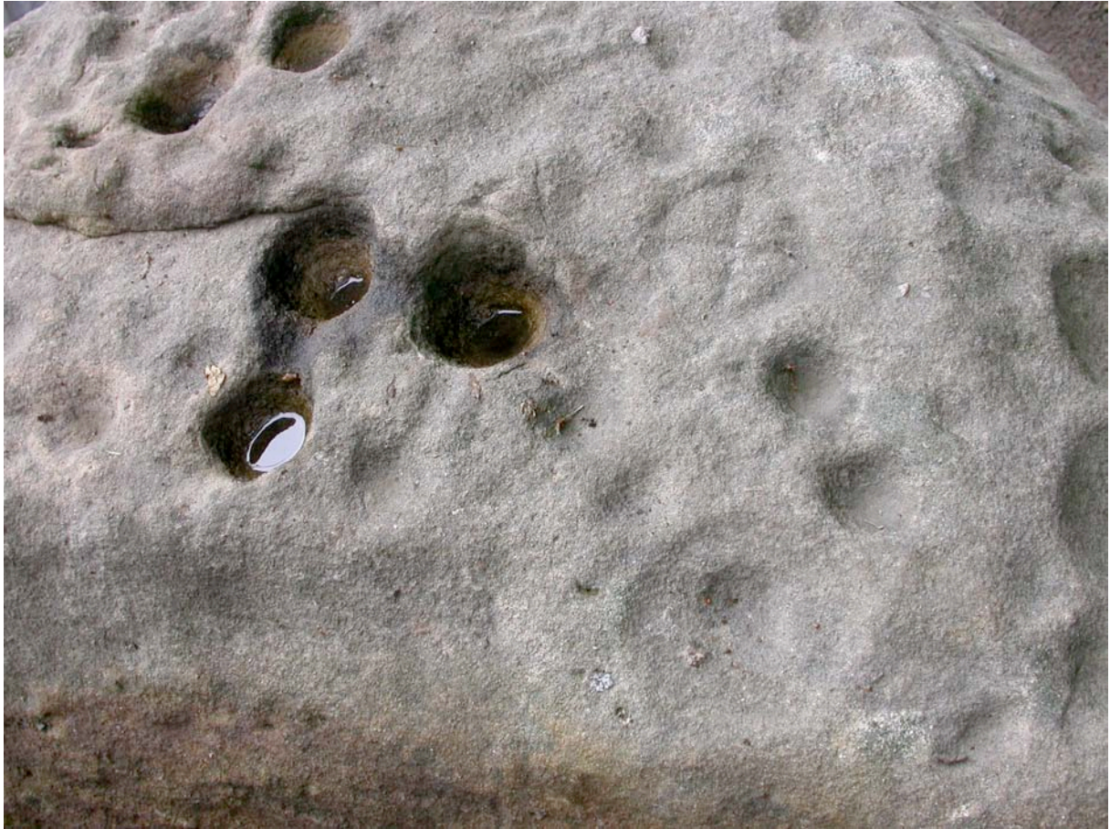
a waggon- or sun-wheel