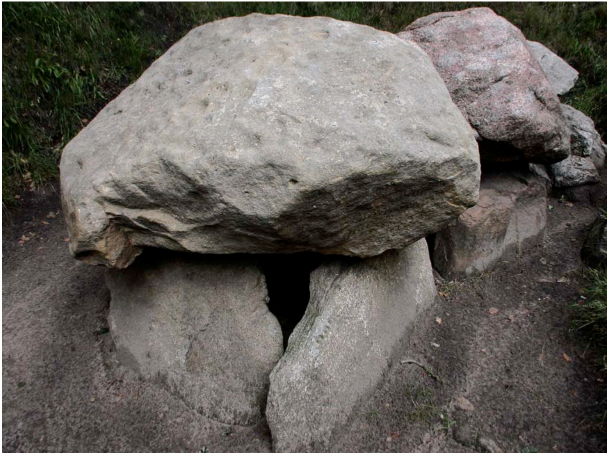
detail of the chamber