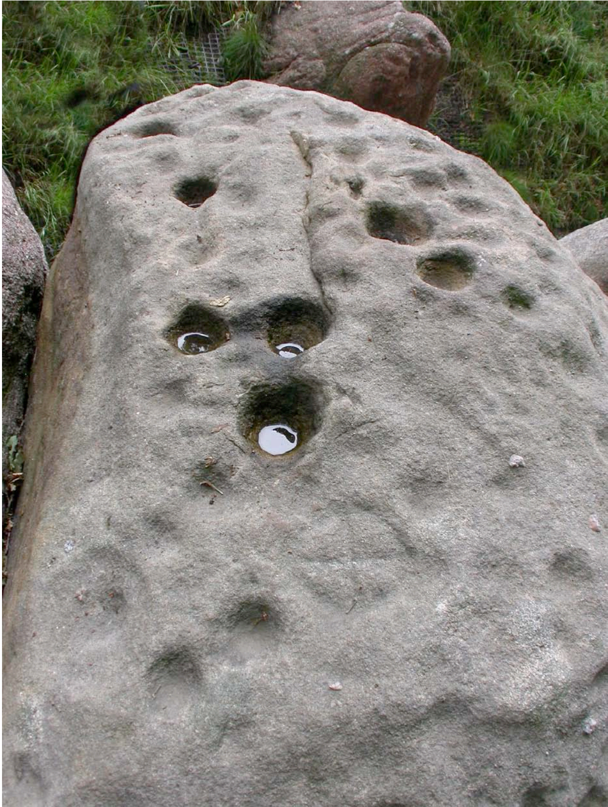
The graved headstone with the waggon or sun-wheel?