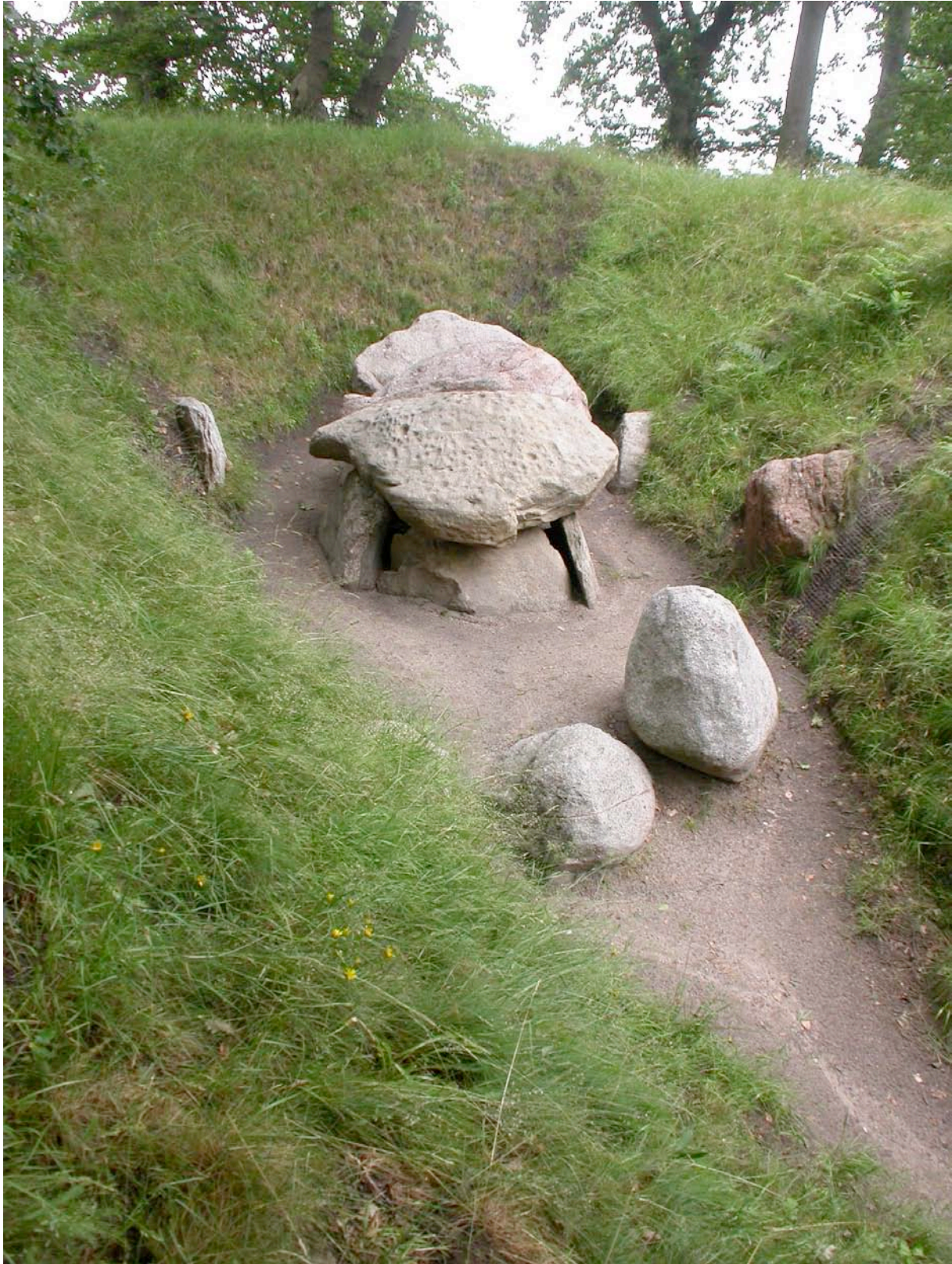
View of the tomb