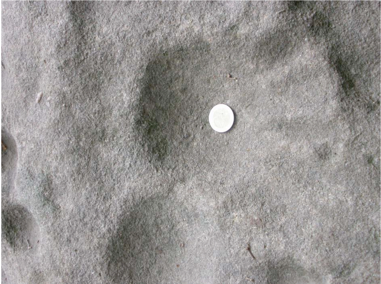
a coin of 1 €uro