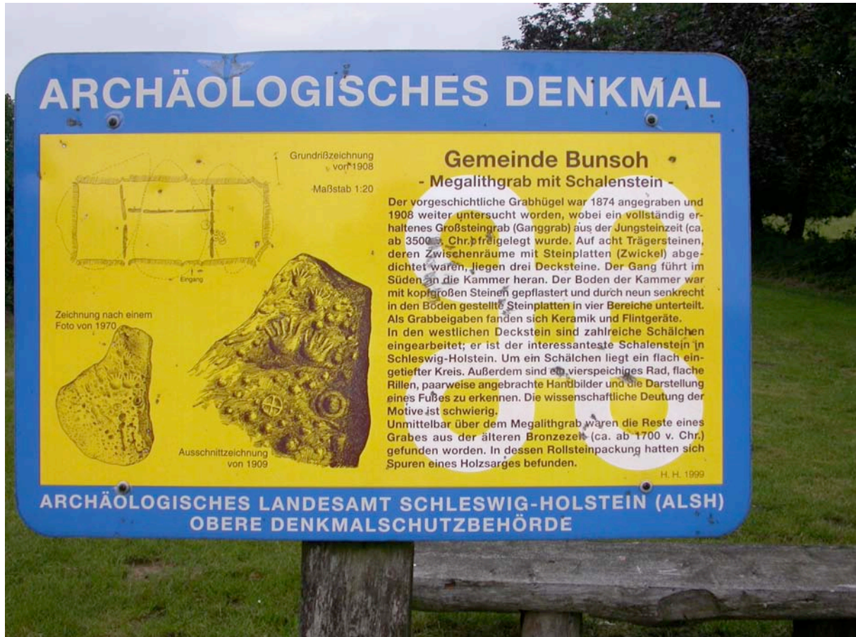
Bunsöh Megalithtomb with cups, handprints and wheel

This is one of the most important burial chambers in the north of Germany, located near the town of Albersdorf.