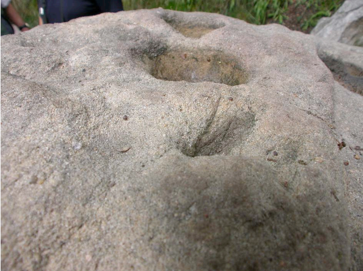
cups with signs