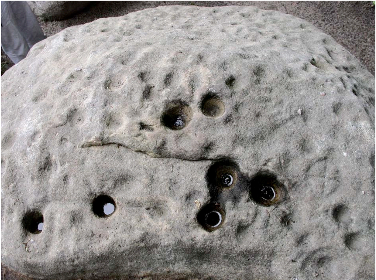
detail of the gravestone