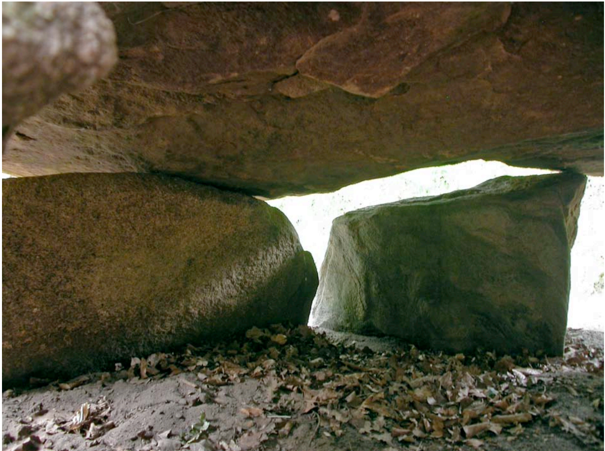
detail of the chamber in- and outside