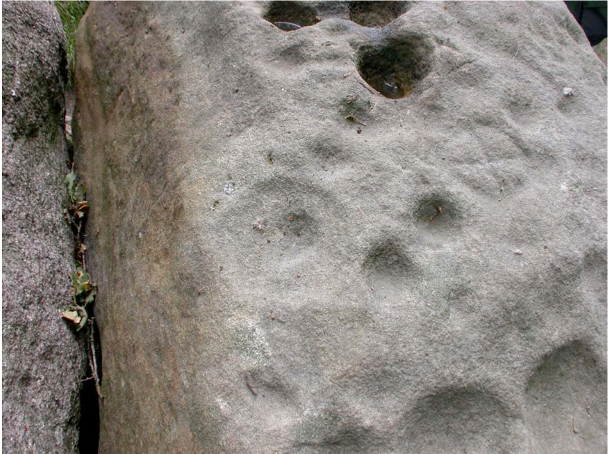
cups with the wheel