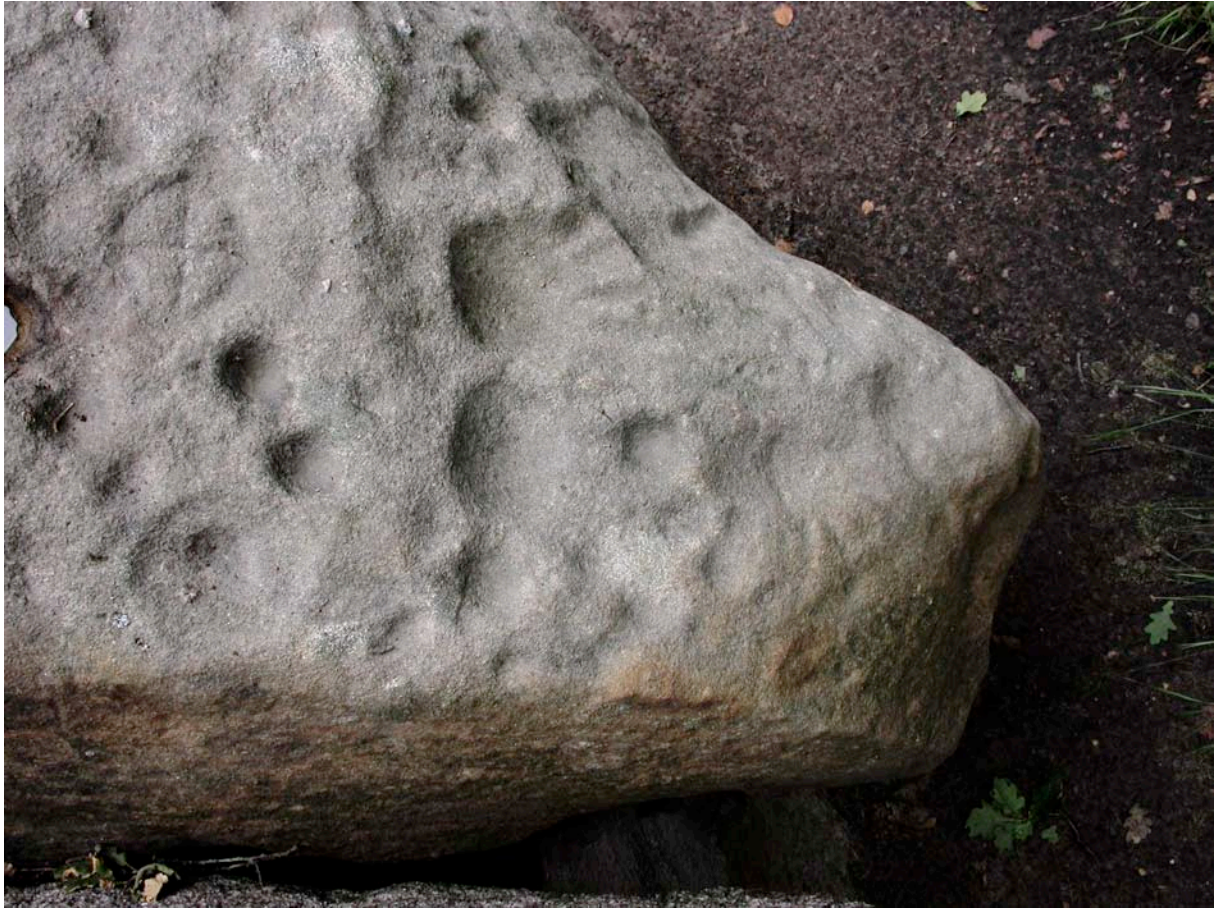
just above the handprints